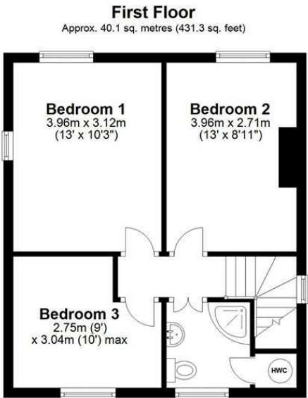
First Floor Approx. 40.1 sq. metres (431.3 sq. feet)